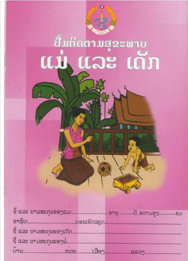
MCH book 3 2010