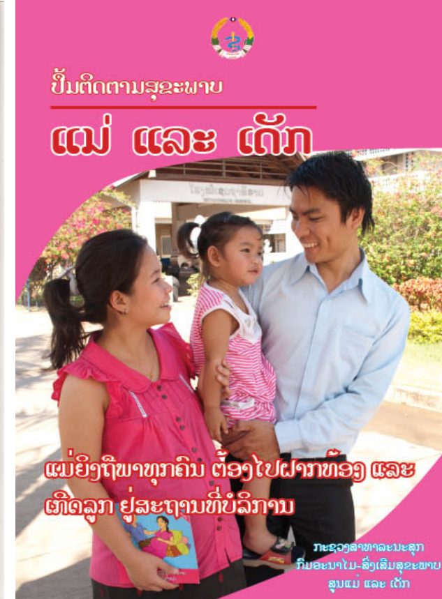
MCH book 4 2015