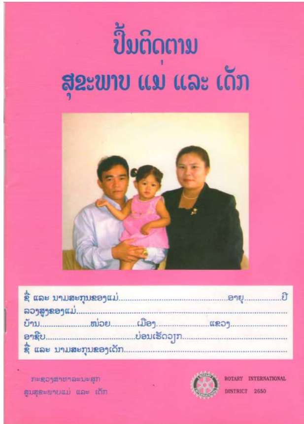
MCH book 2 2007