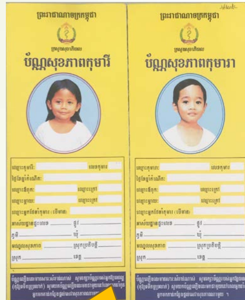
Yellow card (Immunization card)